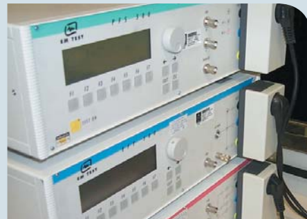
INSTRUMENTS FOR ELECTROSTATIC DISCHARGE AND LINE INTERFERENCE IMMUNITY TEST