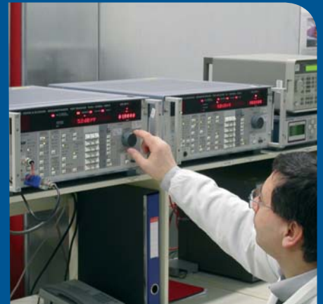
INSTRUMENTS FOR MEASURING CONDUCTED AND RADIATED INTERFERENCE.