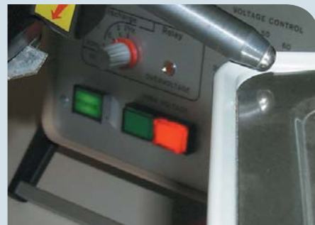
ELECTROSTATIC CHARGE SUSCEPTIBILITY TEST

Additionally, in the case of a successful outcome of the tests a declaration stating the conformity to the applicable law is provided.