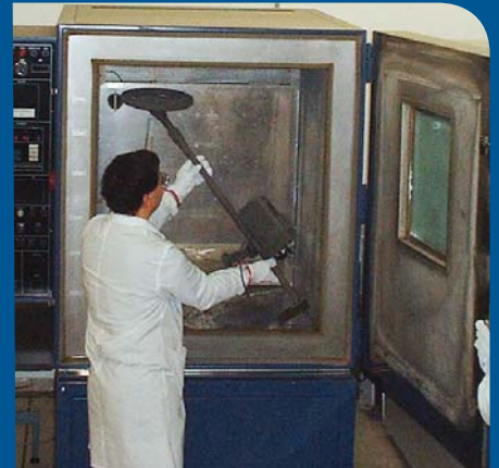
CEIA MIL-D1, THERMAL SHOCK TEST